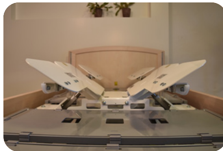
Careturner can cradle and "envelop" the patient giving comfort and stimulating senses, when both wings are elevated.