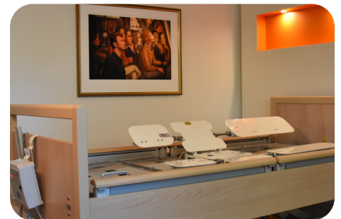
The wings can be elevated up to 80° for moving and handling purposes, such as personal care and sling application