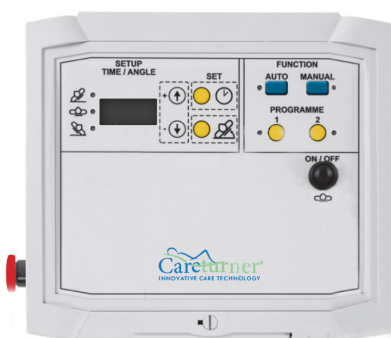
Programmable control box