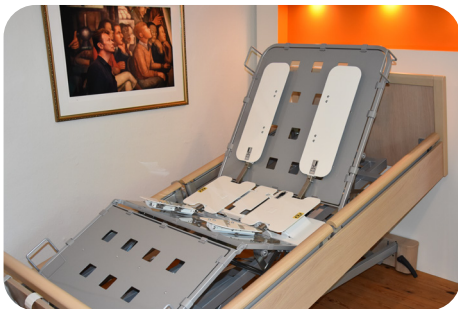
Careturner works in conjunction with the nursing bed to optimize comfort.